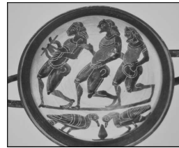
Spartans dancing and playing music