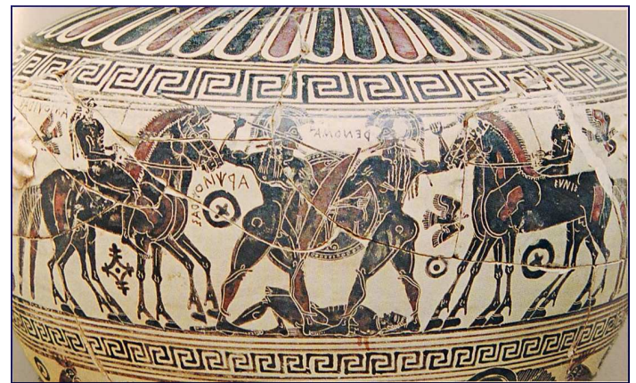
Heroic warriors on a Spartan vase

hero in battle for his country. So, Croesus asked, who was second in happiness, to which Solon replied, two young brothers who were successful athletes and who had died honouring their mother. Croesus dismissed Solon as foolish since he could not recognize how happy Croesus himself was, with his wealth and power. Soon afterwards though, Croesus lost his beloved son, and then his empire, and almost his life, before he recognized the wisdom in Solon's fateful words.