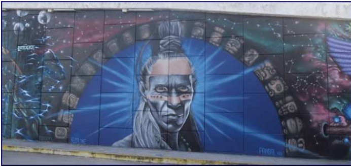
Street mural in Akumal

during the late nineteenth and early twentieth century. Today it has a Yucatec mayor who belongs to Mexico's new ruling MORENA (socialist party). He is using the revenue from tourism to enhance the beauty and safety of the centre of the town. As a result of tourism, the permanent population in the state of Quintana Roo has grown from 50,000 to 1,500,000. There are Yucatec from Quintana Roo and Yucatan, Tzotzil and Tzeltal Maya from Chiapas, Nahua and other migrants from Mexico City, and American and Canadian expatriates. There are also "snowbirds" like ourselves and vacationers. Tourism is a mixed blessing. In the new buildings that local Yucatec call the PLASTICO FANTASTICO, "culture" is for sale. You can buy a miniature pyramid and a sombrero that no sane Mexican would wear. Tourism has put tortillas on the table for many people, and most Maya would be worse off economically without it. However, social inequality, environmental destruction and corruption and organized warfare between drug gangs represent a major challenge to the municipal, state and federal authorities.