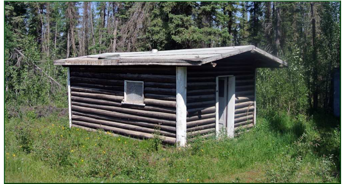
A survival hut on the McKenzie Highway – a life-saver in winter along a stretch of unattended road