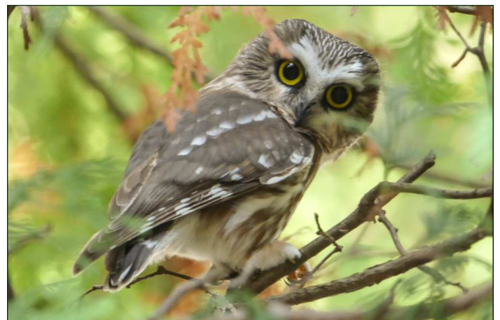
Sawwhet Owl