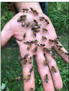
A bee in the hand is worth five in the hive?

– and his specialty is raising queen bees for other apiarists who need them.