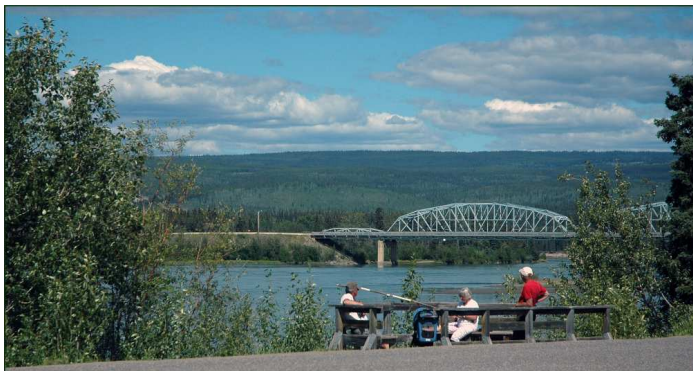
A nice view of Yukon scenery where the Klondike Highway crosses the Yukon River at Carmacks