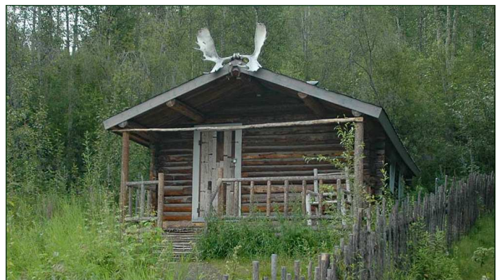
Robert Service's cabin in Dawson City, Yukon – Sam McGee got cremated somewhere around here

"A two-week adventure could start with a flight into Whitehorse. A rental car will allow for access to nearby places like Carcross, the train to Skagway, a day trip to Klune, and other places along the Alaska Highway (AH). The drive up the Klondike Highway to Dawson City can be fast or meandering, but plan to spend at least five or six days in Dawson City and area visiting the town, gold mining displays, the top of the World Highway to Chicken, Alaska, and a day trip to Tombstone Territorial Park.