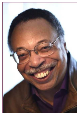
George Elliott Clarke

George Elliott Clarke, professor of English literature at the University of Toronto, past poet laureate of both Canada and the City of Toronto, studied at the University of Waterloo in the 1980s, where I frequently encountered him, mostly in his role as editor of the student newspaper there.